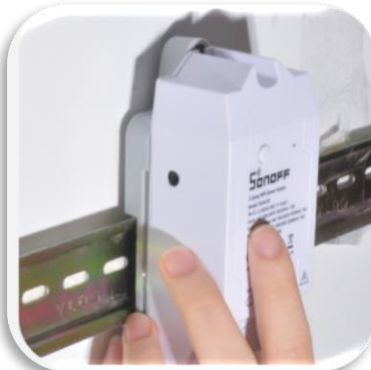
Then mount it on the DIN rail until secure