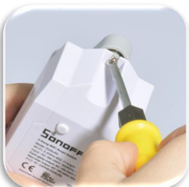
Install the switch on the tray with screws